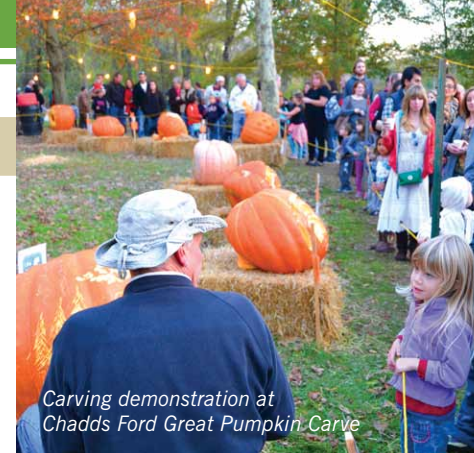
Carving demonstration at Chadds Ford Great Pumpkin Carve