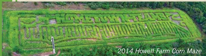
2014 Howell Farm Corn Maze

Here's how it works... each of our 8,000 visitors receives an 11"x17" printed game board. The game board includes ten map clue boxes, which prominently feature our sponsors. Once in the maze, visitors work their way around to find clues and collect puzzle pieces that form a map showing the way out. They also encounter crossword clues and trivia questions which, when answered correctly, help lower their official maze completion time. Our most competitive fans return year after year, hoping to see their name and "top time" in lights on the electronic scoreboard in the main courtyard concession area.